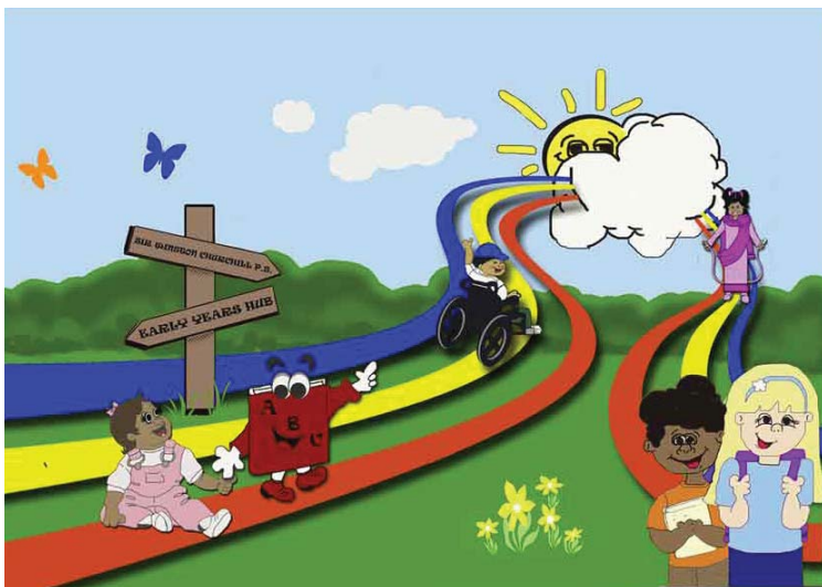
"Pathway to Learning" Early Years Hub, Sir Winston Churchill P.S.