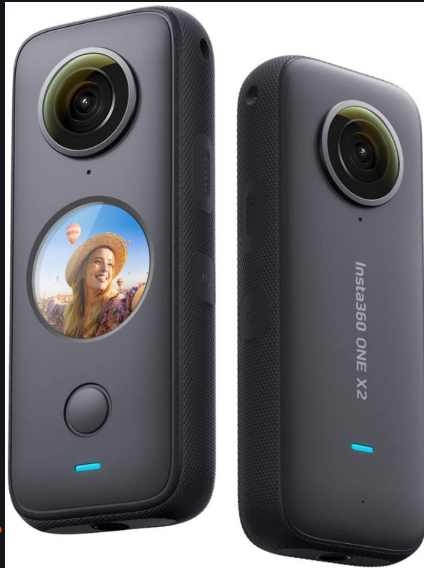
INSTA 360 ONE X 2