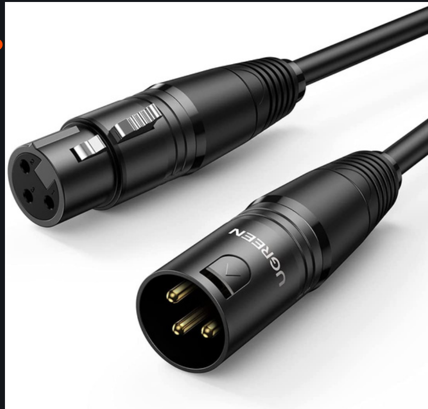
3PIN MALE & FEMALE XLR MICROPHONE CABLE