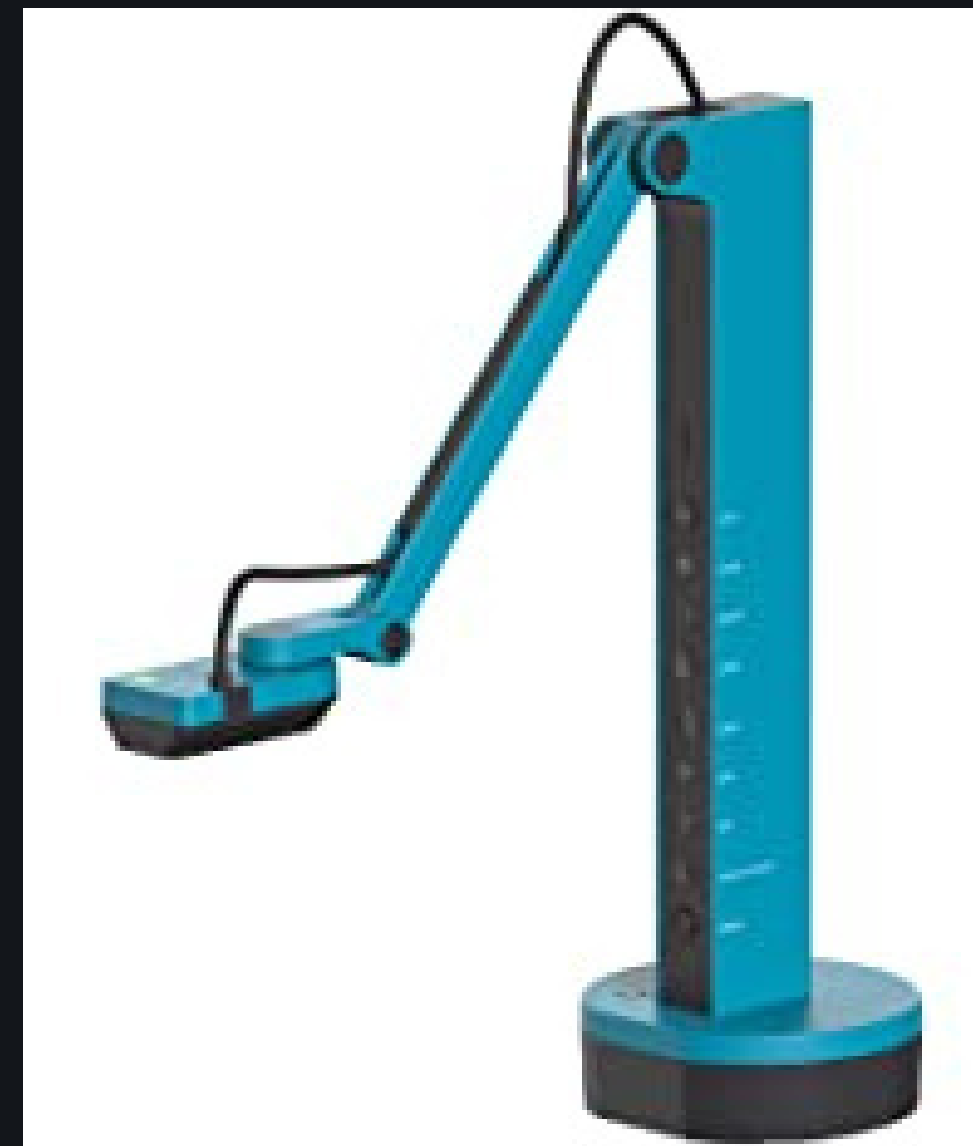
IPEVO VZ-X WIRELESS 8MP DOCUMENT CAMERA