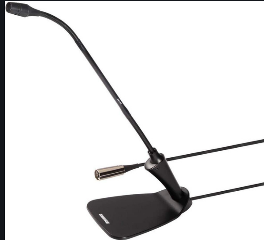
SHURE GOOSENECK CONDENSER MICROPHONE