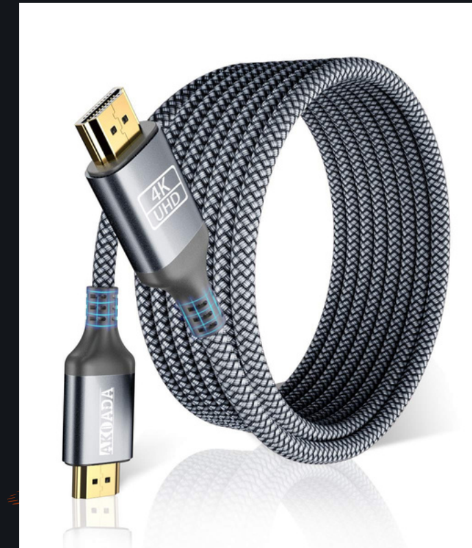
8K HDMI COMPATIBLE WITH ALL 2K TO 4K HIGH SPEED 48GBPS HDMI 2.1