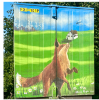
Khaula Siddique (2019) Hurontario at Matheson (2 of 2) (Ward 5)