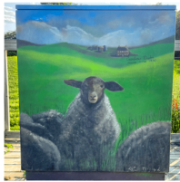
Khaula Siddique (2019) Hurontario at Matheson (1 of 2) (Ward 5)

https://www.mississaugaartscouncil.com/programs/murals-with-mac