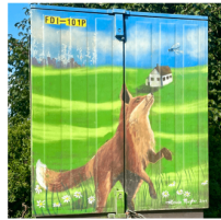
Khaula Siddique (2019) Hurontario at Matheson (2 of 2) (Ward 5)