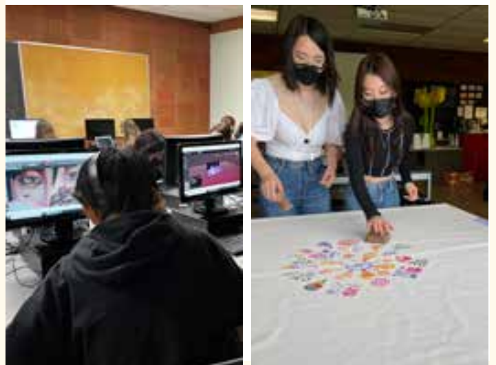
➤ Cawthra Park students participate in the Augmented/Virtual Reality workshops and create a group art project through Mediamakers.