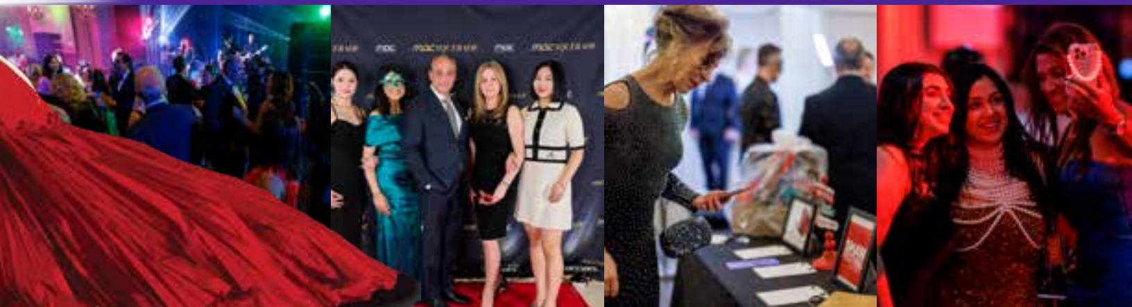
➤ Guests dancing, enjoying the red carpet, perusing the silent auction, and capturing the moment at the Glam Ball.