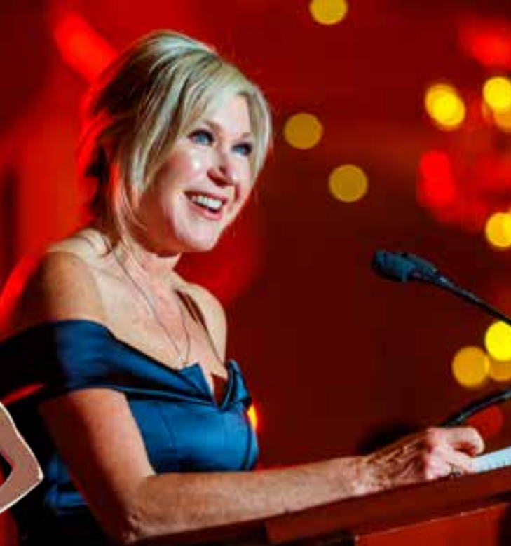
➤ Mayor Bonnie Crombie addresses the crowd at the MACsquerade Glam Ball '22