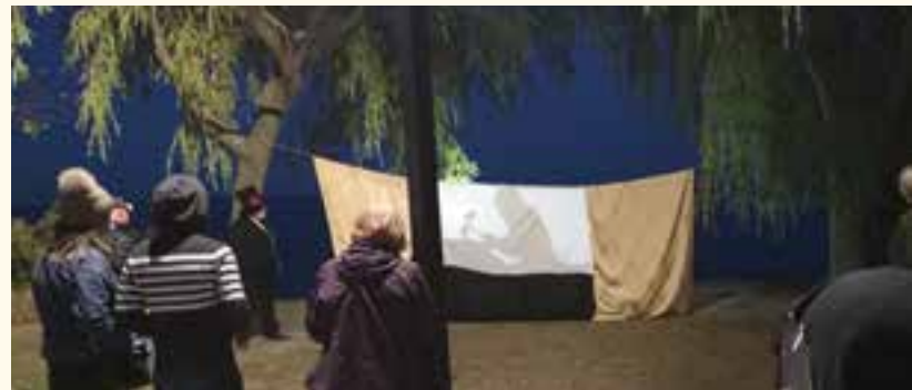
➤ Theatre in the Park MicroGrant winner Za Hughes' 'Ghost Light', an immersive, site-specific play at J.C. Saddington Park.