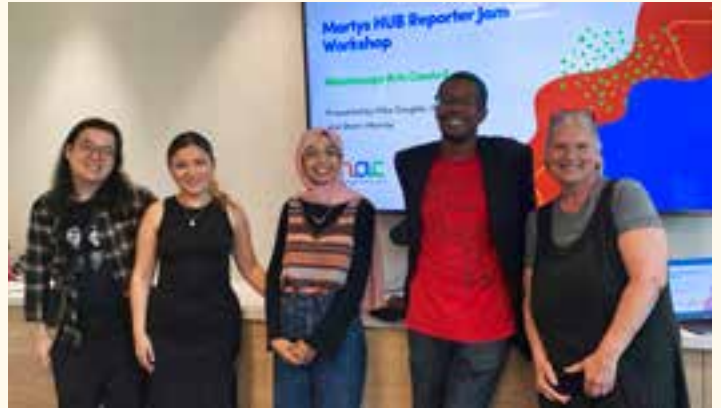
➤ The first cohort of Martys HUB Reporters at Lakeview Discovery Centre for orientation.

The Martys HUB Reporter Jam program was initiated with support from the Community Foundation of Mississauga's Hazel McCallion Fund.