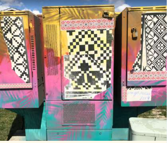
By: Mango P. | Ward 3