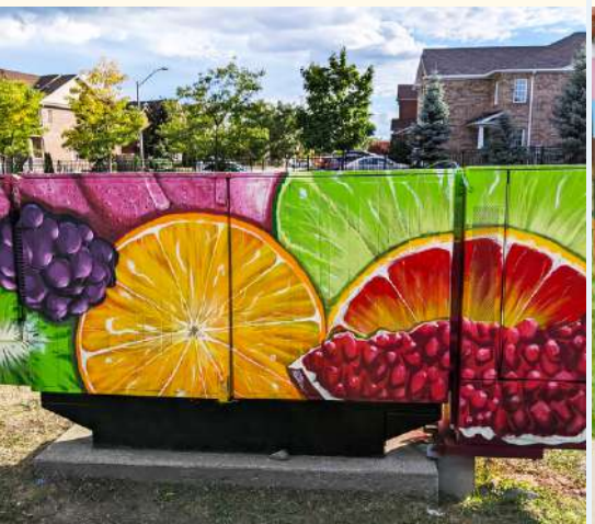
By: Sally C. | Ward 9