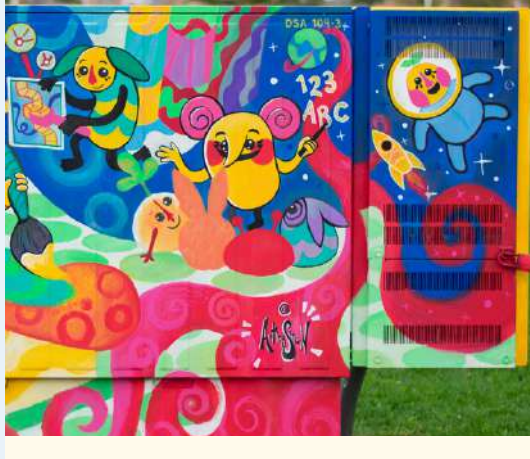
By: Sima N. | Ward 9