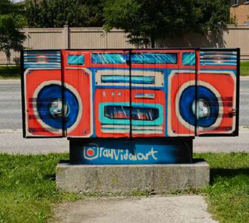
By: Ray V. | Ward 4