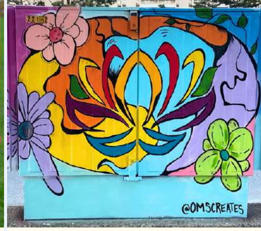
By: Omar H. | Ward 7