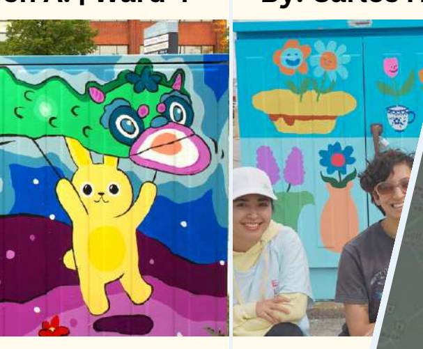
By:Linh T. | Ward 6