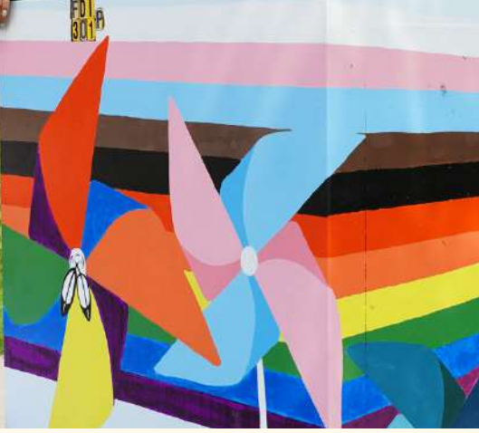
By: Ishleen S. | Ward 2