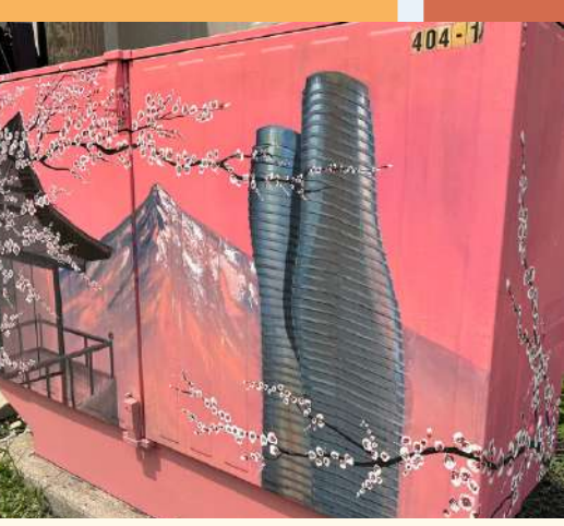
Ward 7

84% shows interest in improving quality of life